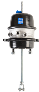
Brake Chambers - Haldex (School Bus)