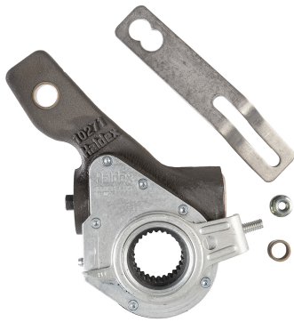
Slack Adjusters - Haldex

Suggest the following to your customers for additional sales: