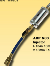
ABP N83 MT4055** Injector R134a 13mm Male QDK x 13mm Female QDK