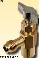
ABP N83 MT1514** Can Tap - Resealable R134a 1/2" Acme Male Thread x 1/2" Acme Female Thread