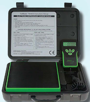
ABP N83 MT1402 Electronic Charging Scale

Every shop needs this starter kit; it contains the basic necessities for leak detection, vacuuming and charging the A/C system in any vehicle.