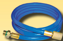
ABP N83 MT0404 72in ABP N83 MT0410 96in

R134a 14mm x 1/2" Acme Refrigerant Hoses