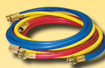
ABP N83 MT0402 72in ABP N83 MT0409 96in