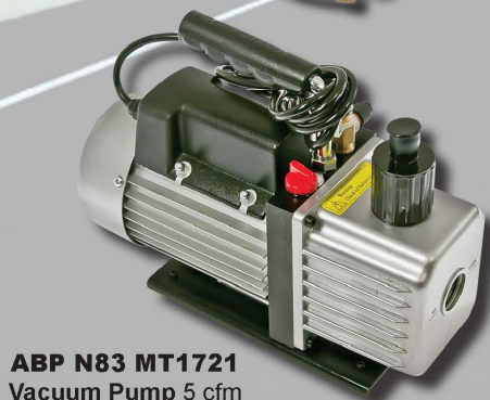
ABP N83 MT1721 Vacuum Pump 5 cfm