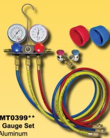
ABP N83 MT0399** Manifold & Gauge Set R134a - Aluminum