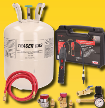
ABP N83 MT7500 Leak Detector Kit H2N2 Hydrogen 5% / Nitrogen 95% ABP N83 MT7501 Leak Detector H2N2 Hydrogen / Nitrogen ABP N83 MT7502 Gas Cylinder H2N2 Hydrogen / Nitrogen ABP N83 MT7503 Regulator Kit H2N2 Hydrogen / Nitrogen ABP N83 MT7504 Coupler H2N2 Hydrogen / Nitrogen ABP N83 MT7505 Replacement Filters H2N2 Hydrogen / Nitrogen