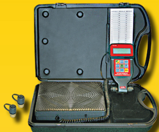
ABP N83 MT1720 Electronic Scale Programmable